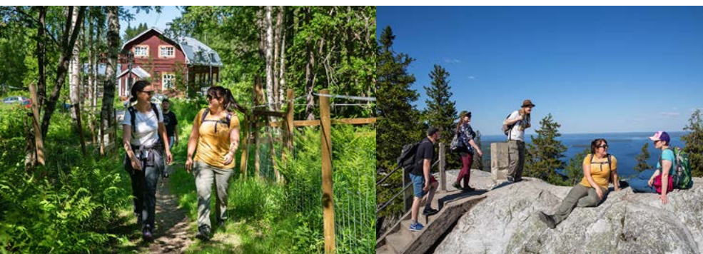
METSÄHALLITUS 12/2022.

INSTRUCTIONS AND RULES: During a forest and grass fire warning, making a fire is not allowed at the Kylän polku Trail campfire sites. Keep pets on a leash and stay on the trail to protect the sensitive nature of the area from erosion. Please read before your trip: nationalparks.fi/hikinginfinland/visitorguidelines nationalparks.fi/kolinp/instructionsandrules