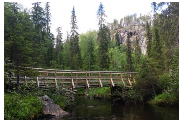
METSÄHALLITUS 2/2022. PHOTOS: JONNA KALLIOMÄKI, MINNA KORAMO, ELINA ODE.