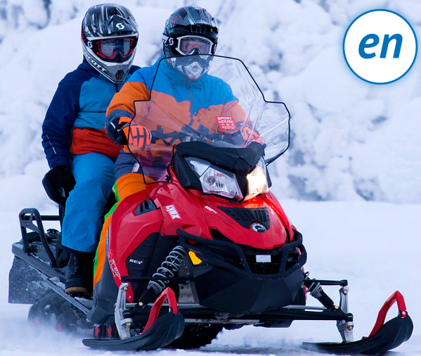
TRANSLATION: AEDAN ZARRELLA METSÄHALLITUS 03/2019. GRANO OY, 1 500 COPIES.