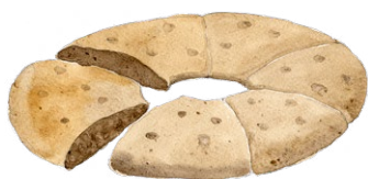
Historical favourite picnic lunch, rye hole-bread.

The hiking area is located 25 km northeast from Rovaniemi along the Highway 4 (E75). Popular starting points are at Vikaköngäs and Vaattunkiköngäs.