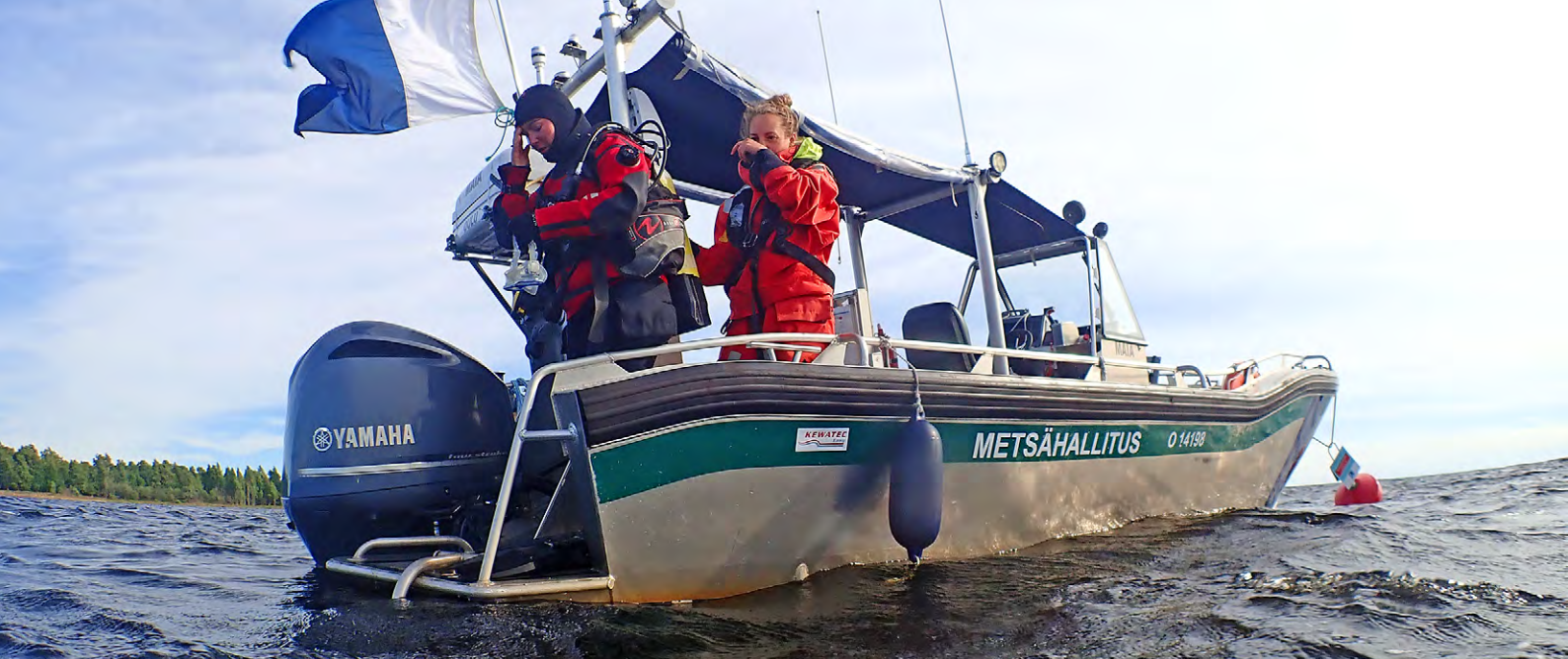
Metsähallitus works actively to assess the state of marine nature in, for example, the five national parks located in maritime areas and the Kvarken Archipelago World Heritage Site. ESSI KESKINEN