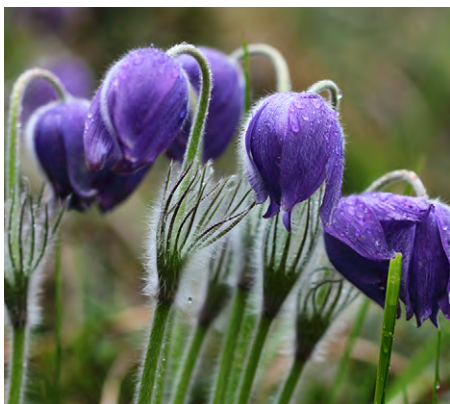
The rare Pulsatilla patens anemone benefited from translocation in the Light & Fire LIFE Project.

National Parks Finland manages state-owned protected lands and waters throughout Finland, securing nature conservation and providing sustainable facilities and services for visitors to these areas.