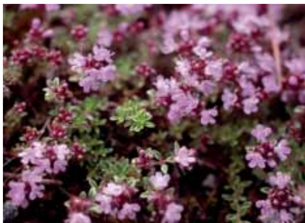
The Wild Thyme ( Thymus serpyllum ) flourishes on eskers and other open, sunlit sites. These are kept open by natural habitat management work. The sites rich in Wild Thyme are important for many threatened butterflies.

Natural Heritage Services looks after threatened and rare species and their habitats. By carefully managing traditional agricultural habitats we protect valuable landscapes and their typical flora and fauna, while also preserving Finland's cultural heritage. Habitat restoration work aims to return areas disturbed by man to their natural state, or as similar a state as possible. The largest groups of threatened species in Finland are associated with traditional rural landscapes and natural forests.