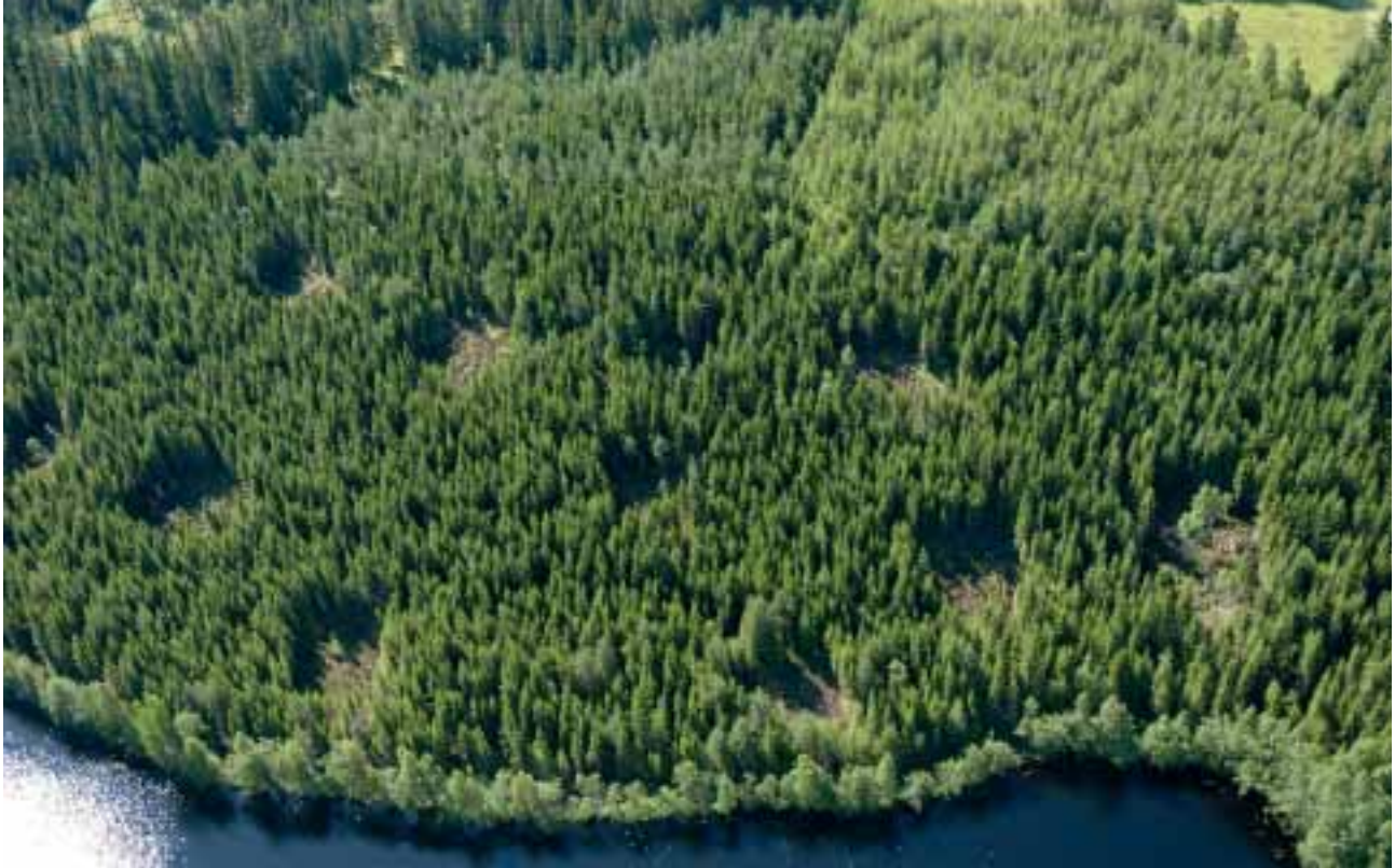
Lentokuva Vallas Oy

Habitat management and restoration schemes aim to preserve biodiversity. Habitat restoration work usually involves one-off measures designed to help forest and mire habitats previously used for commercial forestry to revert to their natural conditions. Habitat management work is carried out repeatedly to maintain valuable semi-natural habitats created by man. Small clearings help restore diversity to uniform forest habitat.