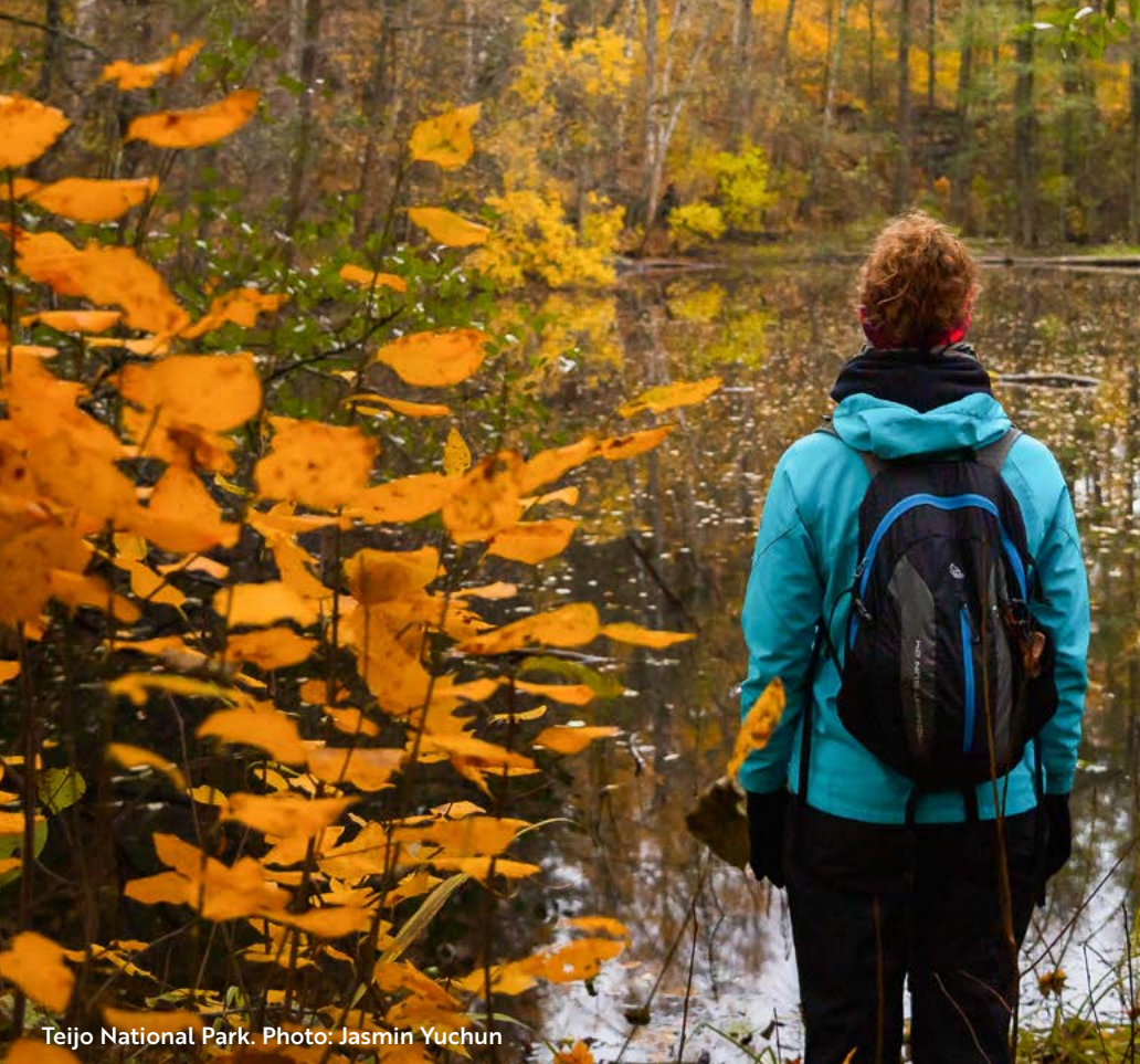
Teijo National Park.