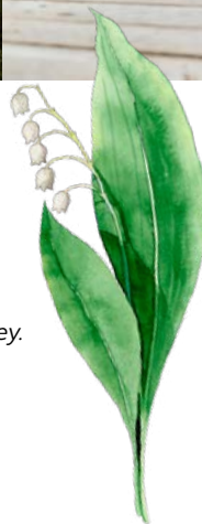
Lily of the Valley.