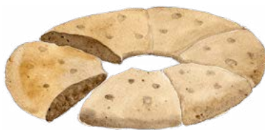
Historical favourite picnic lunch, rye hole-bread.

Hiking and cross-country skiing outside prepared trails are popular forms of recreation in the area. Olkkajärvi Lake, Vikajärvi Lake and Raudanjoki River offer great opportunities for fishing, rowing, kayaking and rafting. You can start the hikes from Vikaköngäs or Vaattunkiköngäs parking areas.